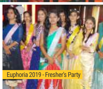
Euphoria 2019- Fresher's Party