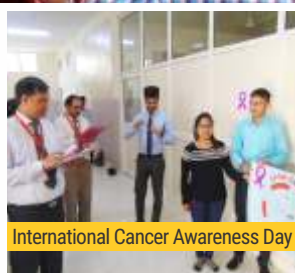
International Cancer Awareness Day