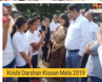
Krishi Darshan Kissan Mela 2019