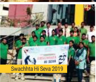
Swachhta Hi Seva 2019