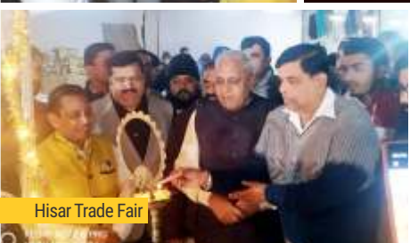
Hisar Trade Fair