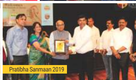
Pratibha Sanmaan 2019