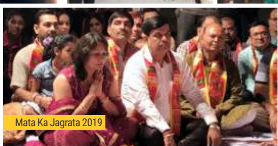
Mata Ka Jagrata 2019