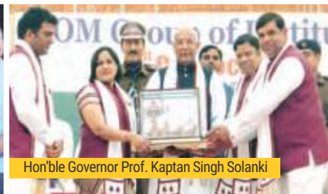
Hon'ble Governor Prof. Kaptan Singh Solanki