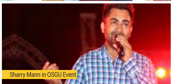
Sharry Mann in OSGU Event