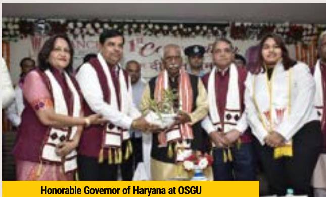
Honorable Governor of Haryana at OSGU