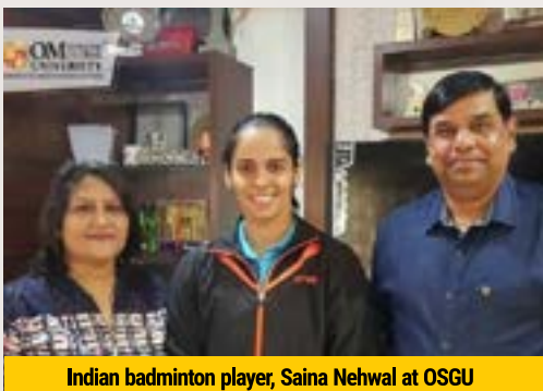
Indian badminton player, Saina Nehwal at OSGU