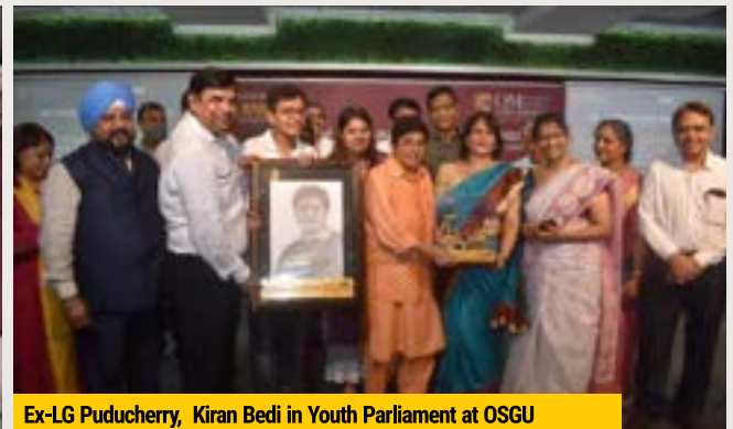
Ex-LG Puducherry, Kiran Bedi in Youth Parliament at OSGU