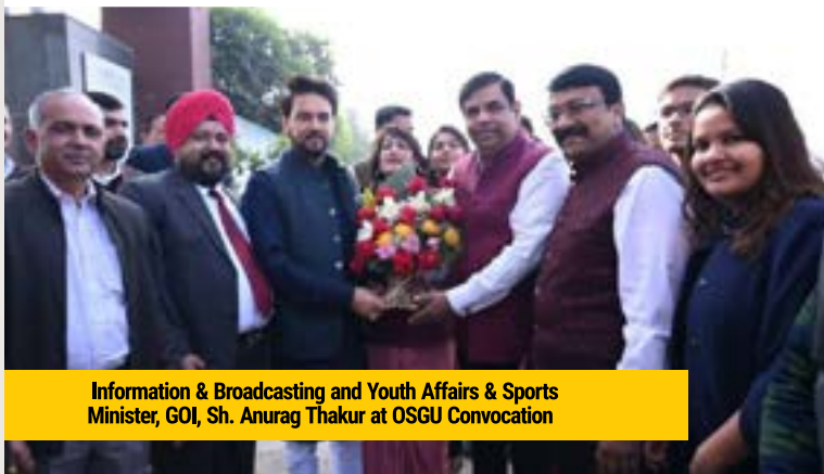
Information & Broadcasting and Youth Affairs & Sports Minister, GOI, Sh. Anurag Thakur at OSGU Convocation