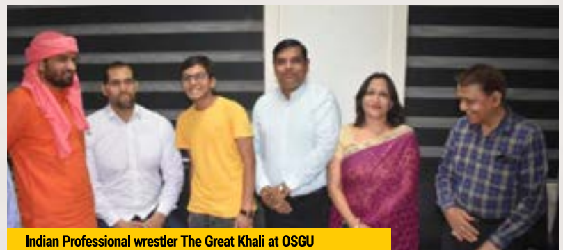
Indian Professional wrestler The Great Khali at OSGU