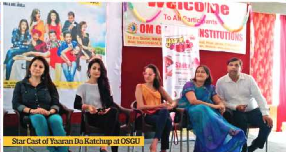
Star Cast of Yaaran Da Ketchup at OSGU