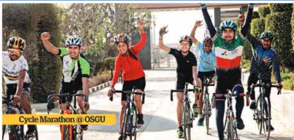
Cycle Marathon @ OSGU