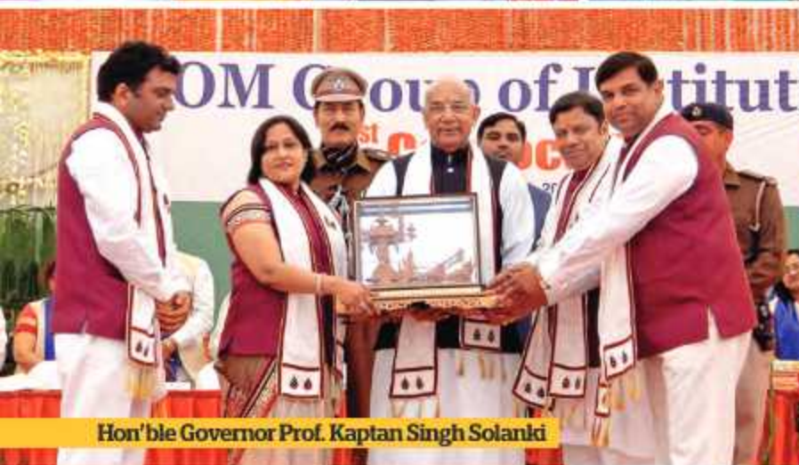
Hon'ble Governor Prof. Kaptan Singh Solanki