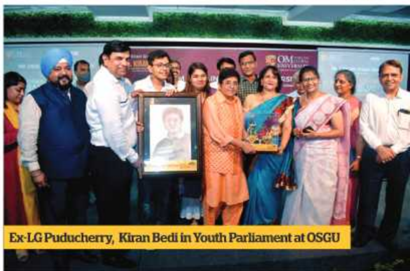
Ex-LG Puducherry, Kiran Bedi in Youth Parliament at OSGU