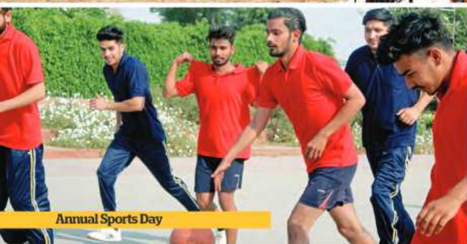
Annual Sports Day