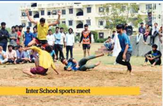
Inter School sports meet