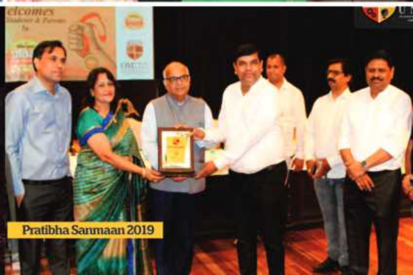
Pratibha Sanmaan 2019