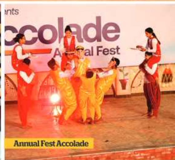
Annual Fest Accolade