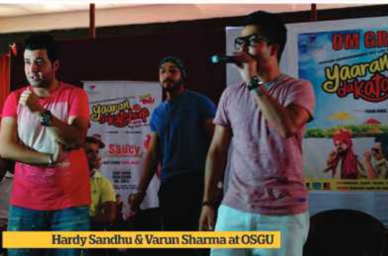
Hardy Sandhu & Varun Sharma at OSGU