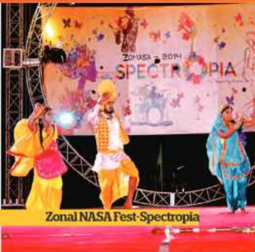
Zonal NASA Fest-Spectropia