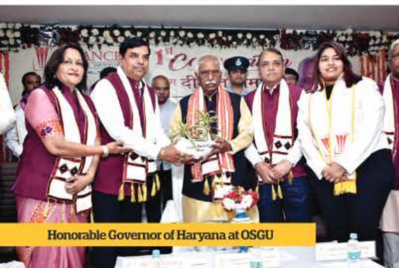
Honorable Governor of Haryana at OSGU