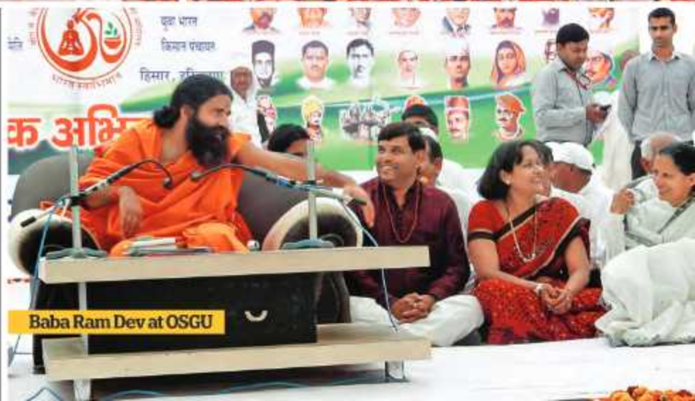
Baba Ram Dev at OSGU