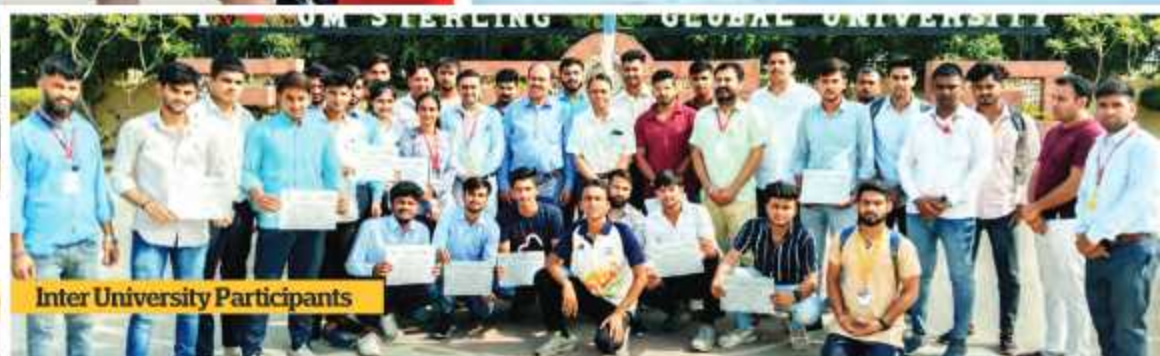
Inter University Participants