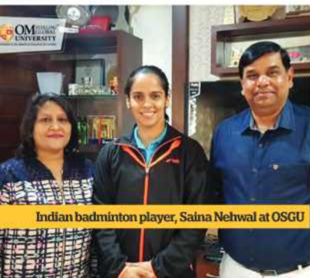
Indian badminton player, Saina Nehwal at OSGU