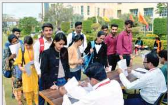
Placement Pool Campus Drive

CRC Department also supports to see feasibility in Collaborations and bilateral tie-ups with Foreign Universities and Institutes across the globe for various courses at UG and PG Level and strive to provide a platform to the students to study culture consciousness abroad.