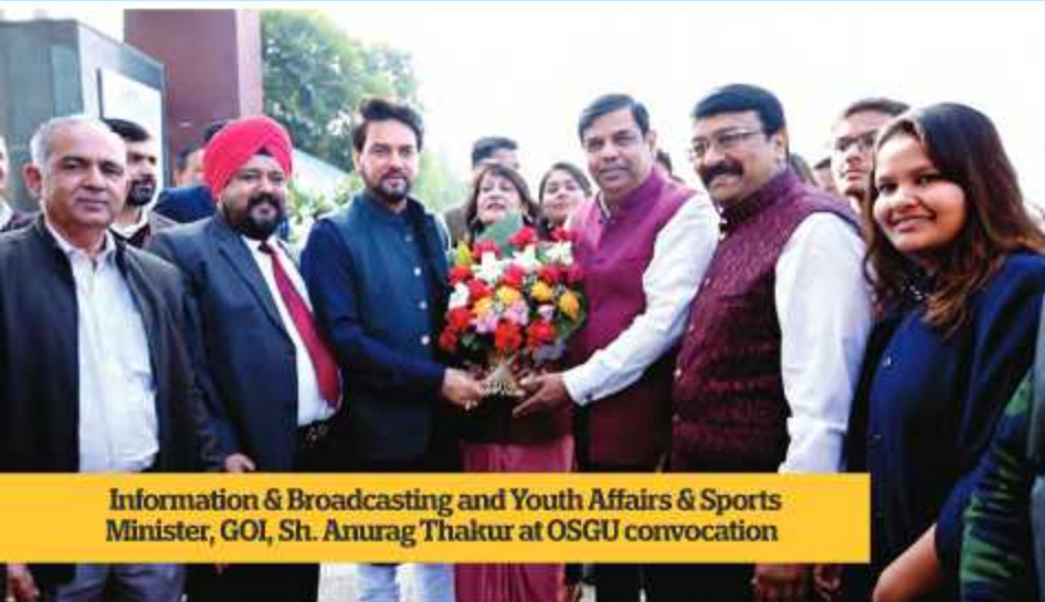
Information & Broadcasting and Youth Affairs & Sports Minister, GOI, Sh. Anurag Thakur at OSGU convocation