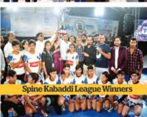
Spine Kabaddi League Winners