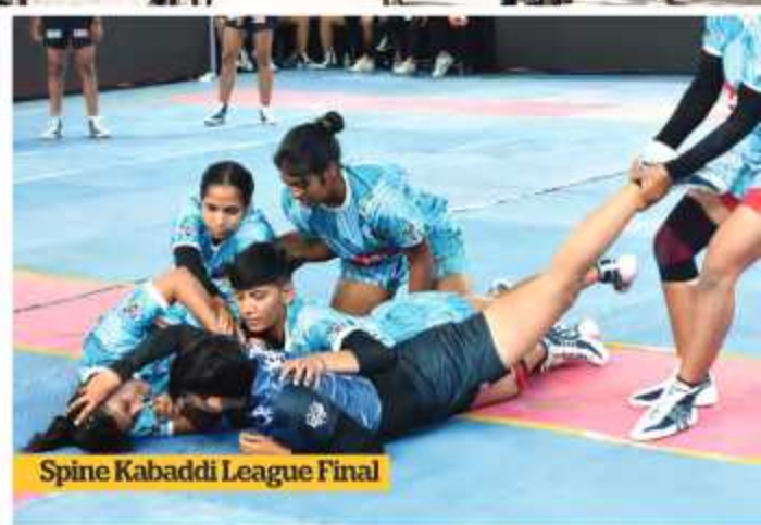
Spine Kabaddi League Final