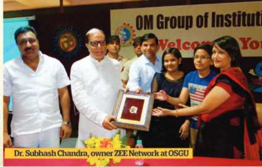
Dr. Subhash Chandra, owner ZEE Network at OSGU