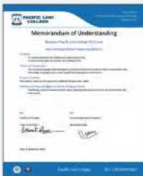
MoU with PLC, Canada for Student Exchange Program