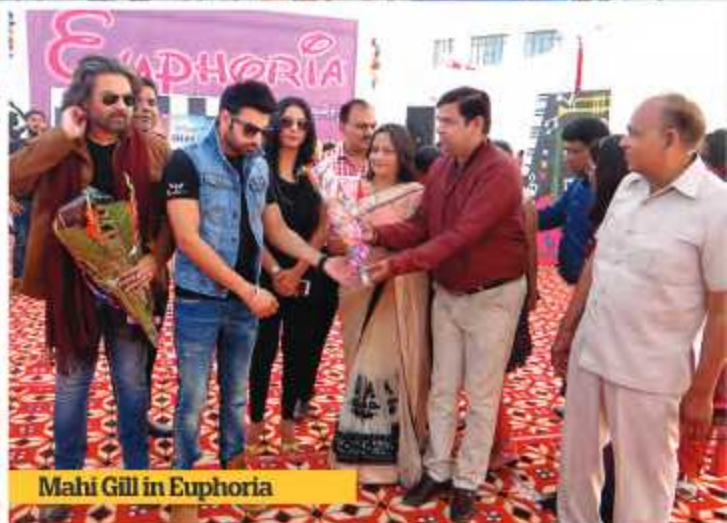
Mahi Gill in Euphoria