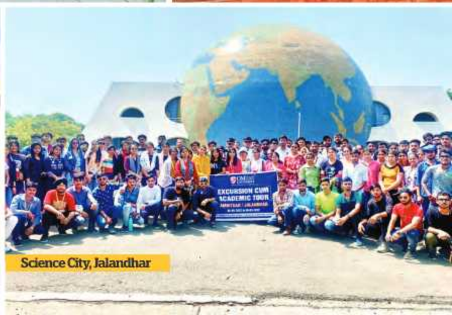
Science City, Jalandhar