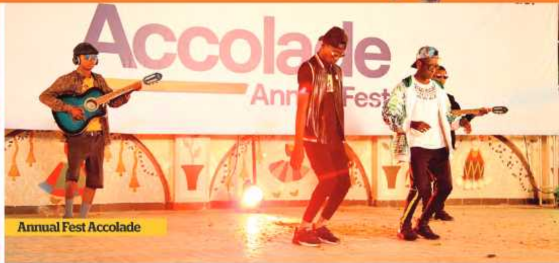
Annual Fest Accolade