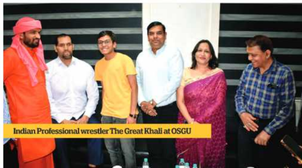
Indian Professional wrestler The Great Khali at OSGU